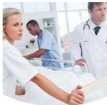
Birth and transfer