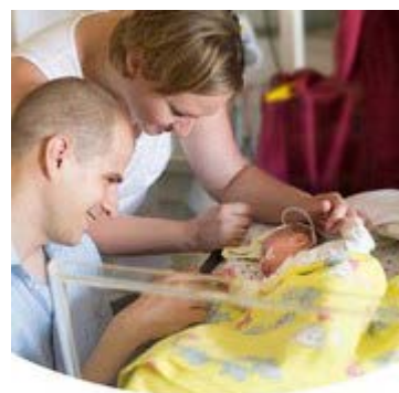
Infant- and family-centred developmental care EFCNI