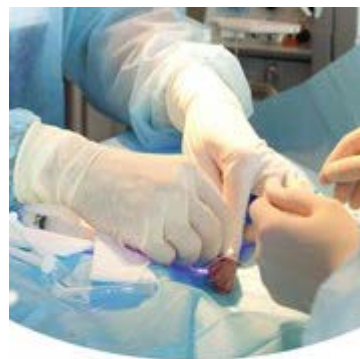
Medical care and clinical practice